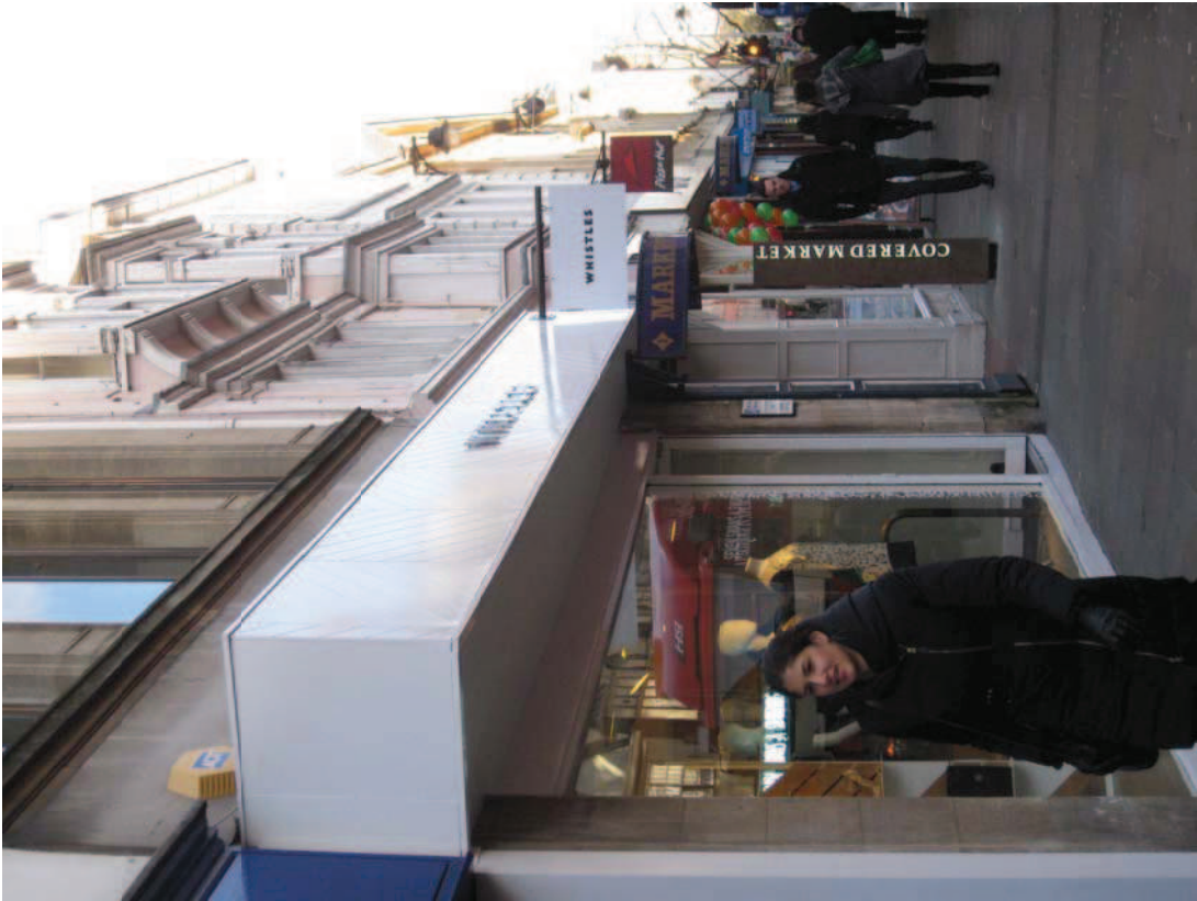
High Street view