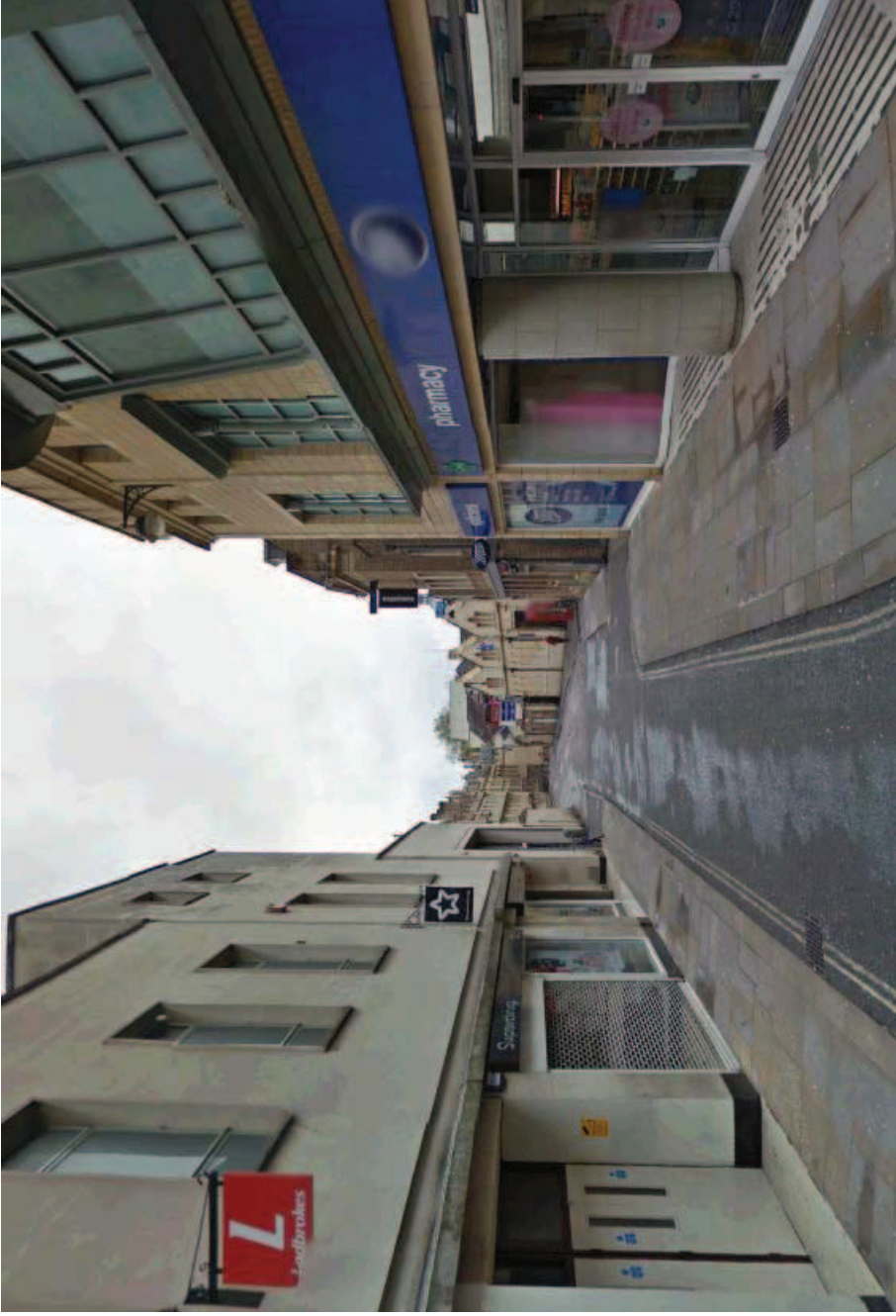
Market Street, looking towards the Market: existing