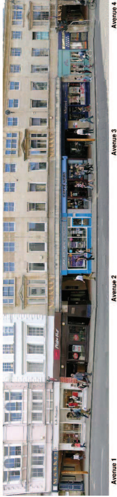
High Street elevation: proposed overhead signs