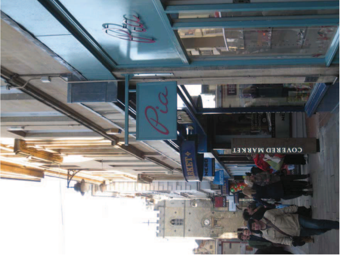
High Street view