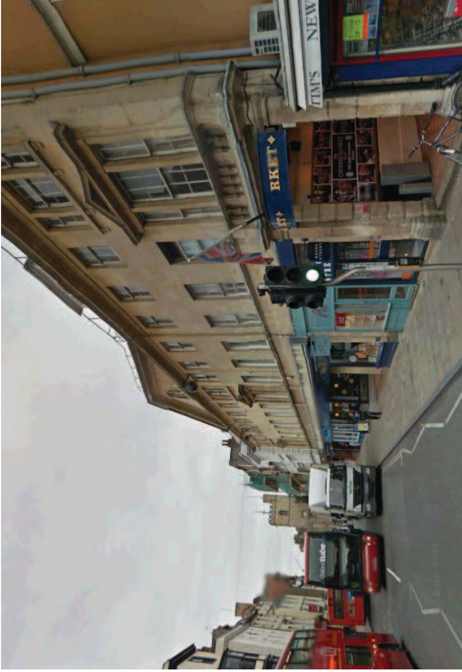
High Street: existing